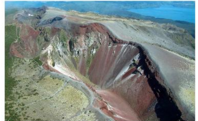
Mount Tarawera and Lake