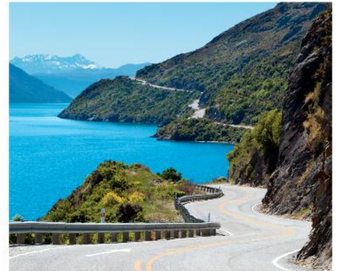
Drive to Fjordland

Journey into Fjordland National Park for a wilderness cruise through magnificent Doubtful Sound. As we navigate these pristine waters, take in the majesty of the fiords and their surrounding cliffs, blanketed in lush forest and sprinkled with waterfalls. Keep your eyes peeled for dolphins and fur seals! (Breakfast / Lunch)