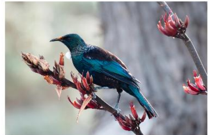
Birdwatching on Matangi Island

Board a ferry to Tiritiri Matangi Island, home to one of New Zealand's bird sanctuaries. Learn about conservation efforts here while seeking out endangered bird and reptile species, including the flightless takahe and the tuatara. This evening, enjoy free time to discover Auckland, known as the "city of sails" for the many sailboats that teem in its harbor. Overnight in Auckland. (Breakfast / Lunch)