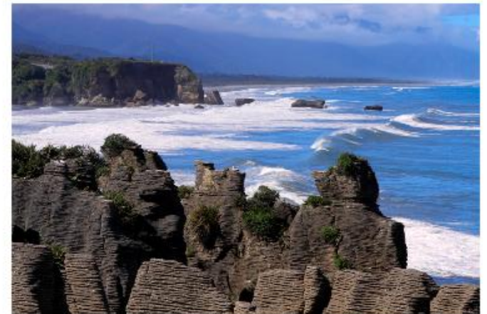
Punakaiki Pancake Rocks

This morning we visit to the World of Wearable Art and Collectable Cars Museum. View a stunning selection of more than 60 wearable art garments, alongside more than 140 veteran, vintage and classic cars. The Museum showcases two very distinct collections that collide in a celebration of design, innovation and wonder. We head to Punakaiki, with its dramatic coastal scenery. This small town is most famous for the Pancake Rocks and their impressive blowholes. Overnight in Punakaiki. (Breakfast / Dinner)