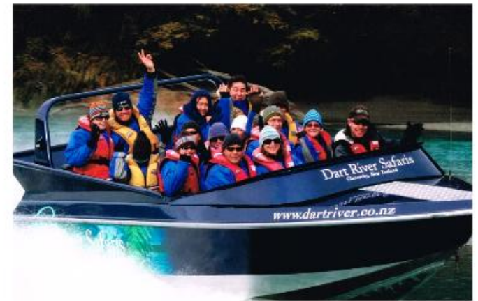
Dart River Jetboating

On your final full day in New Zealand, venture into the undulating landscapes of the Southern Lakes District and experience the tranquility of Lake Wakatipu's cerulean waters. After taking in the spectacular surrounding landscapes along the way, arrive at the lakeside village of Glenorchy. We continue to historic Kinloch Lodge to enjoy lunch on the grounds. After lunch we board a jetboat for a spectacular journey deep into the heart of the world-renowned Mount Aspiring National Park. Experience a unique combination of breath-taking scenery and an exhilarating ride as we follow the braided, glacier-fed river by jet boat. Your skipper shares stories about the area's rich history, the Greenstone trail and Maori legends. We'll also tie up the boat to walk amongst the ancient beech tree forests. Return to Queenstown and celebrate your time in New Zealand with a festive farewell dinner. (All Meals)