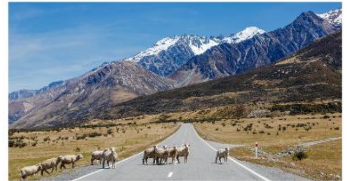
Farewell to New Zealand

The tour officially ends after breakfast this morning. We provide transfers to the airport for your return flight today. If you wish to extend your stay in Queenstown, please let us know on your reservation form so that we can keep your room available for another night. (Breakfast)