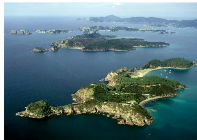
Bay of Islands

Arrive in Auckland and settle into our historic hotel. Join your fellow travelers for a welcome dinner this evening. Auckland and surrounding suburbs have a population of approximately 1.5 million. It is New Zealand's largest city and spreads generously over a narrow isthmus between the Pacific Ocean and Tasman Sea. Over 60 extinct volcanic cones and craters characterize the landscape, while an endless procession of sails in the harbor is typical of the relaxed way of life here. Auckland was the state capital until 1865 and is today the economic center of New Zealand. Overnight in Auckland. (Dinner included)