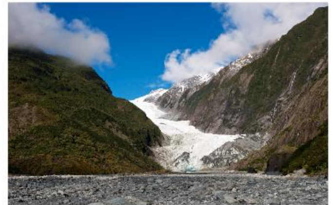
Franz Josef Glacier

We set off for Franz Josef, a tranquil village nestled among the native forest of the West Coast and overlooked by the massive peaks of the Southern Alps. Not to be missed here is the famous Franz Josef Glacier, which we discover with a scenic helicopter flight which lands us on the Glacier. Along with its twin, the Fox Glacier, Franz Josef is the most low-lying glacier of its type in the world. This afternoon we take a behind the scenes tour of the West Coast Wildlife Centre. Here you can learn about the region and New Zealand's rarest kiwi, the Rowi. This evening we recommend the Glacier Hot pools. Pop in for a relaxing soak in the public pools or pre-book a private pool for the ultimate experience (own arrangements). Overnight at Franz Josef Glacier. (B,D)