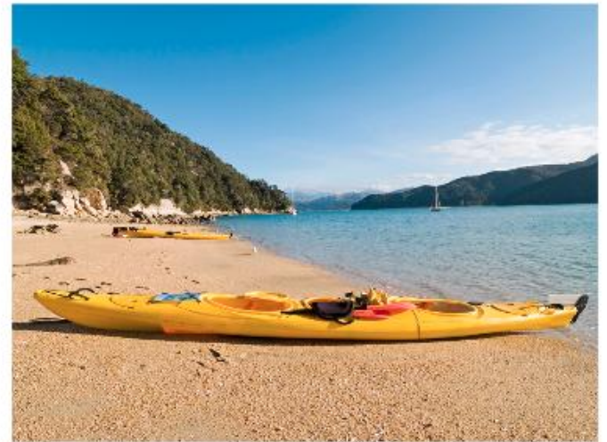
Abel Tasman Kayaking

Overnight in Nelson. (Breakfast / Lunch)