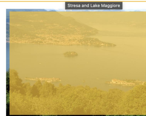
Stresa and Lake Maggiore

Despite its name, Maggiore is not the largest lake in Italy, but it is certainly the most famous. Visit the Borromean Islands, named after the family who owned the lake in the 15th century. A barren rock until developed by Count Carlo III Borromeo in the 17th century, Isola Bella was named after his wife Isabella, embellished with grottoes, gardens and white peacocks. After touring the palace continue to the fisherman's island, Isola dei Pescatori, and enjoy free time for lunch before returning to Stresa. (Breakfast)