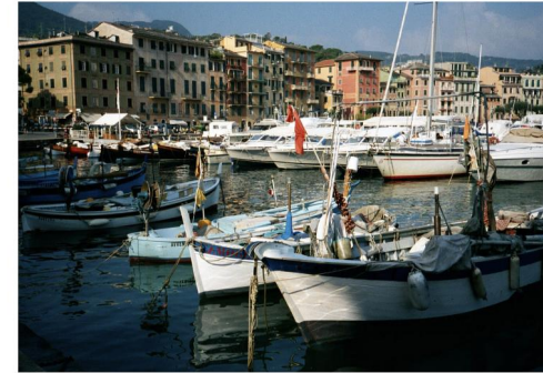
Santa Margherita Ligure

We depart Como by private vehicle, crossing the mountains to the resort town of Santa Margherita Ligure, situated on a secluded bay at the beginning of the Portofino peninsula. After checking in at our hotel, enjoy the rest of the day at leisure before reconvening for an included dinner. (Breakfast / Dinner)