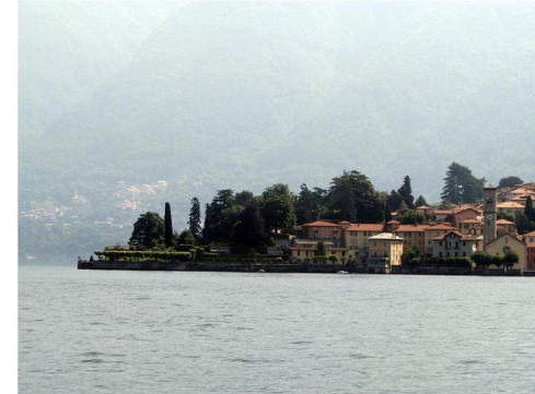
Cruising on Lake Como