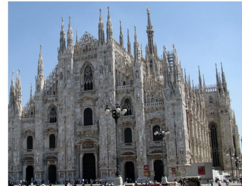
Il Duomo Milan

After a leisurely morning, we take breakfast and then check out of our hotel. We transfer back to Milan for a final afternoon and evening at leisure. Overnight in Milan. (Breakfast)