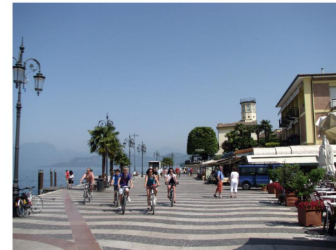
Free Day in Sirmione

We have a free day to explore Sirmione, where our hotel is located. Sirmione is situated on a peninsula which juts out from the southern shore of the lake, combining a medieval old town with luxurious vegetation. Visit the Castello Scaligero, built in the 13th century, or the remains of the villa of the Roman poet Catullus (neither included). This evening, we reconvene at our hotel and walk the short distance into Sirmione town for an included dinner. (Breakfast / Dinner)