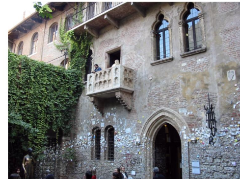
Juliet Balcony Verona

We transfer by private vehicle to Verona, one of the richest and most elegant cities in northern Italy. It was a Roman colony, and several historical sites from that time, including the Arena where the yearly opera festival takes place, are well preserved. William Shakespeare set both Two Gentlemen of Verona and Romeo and Juliet in this city, the latter based on a true story from the year 1302. Enjoy a guided tour of the old town, built in a bend of the river Adige, full of historic buildings, attractive squares and beautiful shops. In the late afternoon, we continue to Sirmione on Lake Garda. Enjoy dinner at our hotel following check-in. (Breakfast / Dinner)