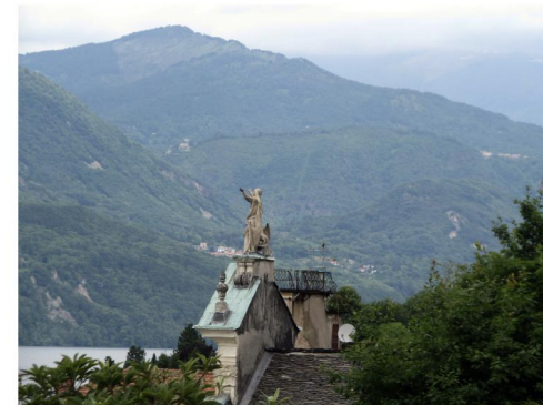
Farewell to the Lake District

The tour officially ends after breakfast. Milan's Malpensa airport is conveniently situated about 40 minutes from Como, and transfers can be arranged. Or continue on to Santa Margherita Ligure if you are taking the Cinque Terre extension. (Breakfast)