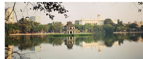
Hoan Kiem Lake