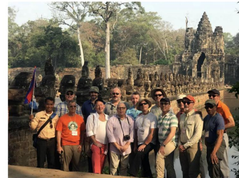
Toto Group at Angkor Thom