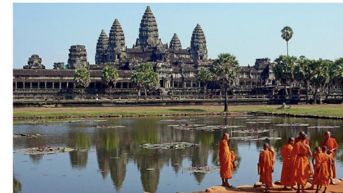
Buddhist Monks at Angkor Wat

Enjoy lunch at a local restaurant, and then continue our explorations to visit Banteay Srei, a pre-Angkorian temple located in the quiet countryside northeast of Siem Reap. Known as the "Citadel of Women," the pink sandstone temple was built by a Brahmin priest in the 10th-century and contains some of the finest examples of classical Khmer art. This evening we bid farewell to Cambodia with dinner at a local restaurant. (All Meals)