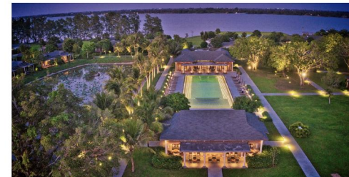
Our Beautiful Mekong Resort