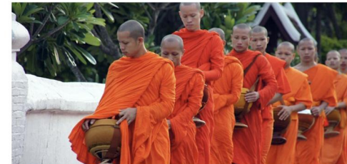
Almsgiving in Luang Prabang

Experience a quintessential Lao morning, starting with a spiritual tak bat, or almsgiving ritual. Each morning, locals line the streets to make offerings and receive blessings from monks who walk through the town in single file. Join them in giving alms and taking part in this timeless tradition. After the ceremony, visit the morning market where locals pick up their daily supply of fresh fruits and vegetables. Return to your hotel for breakfast. Enjoy leisure time until it is necessary to depart the hotel and transfer to the airport for your onward flight. (Breakfast)