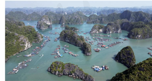
Dramatic Limestone Formations in Ha Long Bay

Return to the cruise ship for a cooking demonstration followed by dinner. In the evening, enjoy on-board activities such as squid fishing, playing board games, or more pampered spa time. (All Meals)