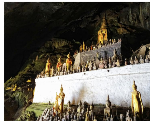
Buddha Status in the Pak Ou Caves