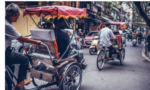
Cyclo Ride in Old Hanoi