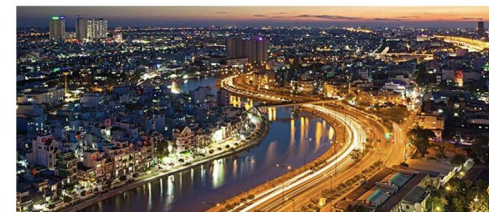
Saigon at Night