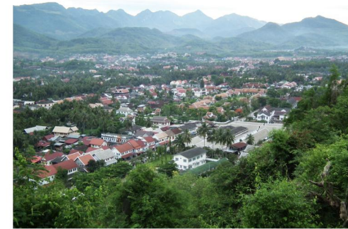
Peaceful and Spiritual Luang Prabang

Fast-Track services are arranged for our arrival at the airport. Upon exiting the aircraft, we are met by a representative who collects our passports and documents (two passport photos per person) and assists with our visa on arrival application and express immigration process. The representative then accompanies us through luggage collection and customs before leading you into the arrival hall, where we meet our guide and begin the transfer to our hotel. Enjoy dinner at our hotel tonight. (All Meals)