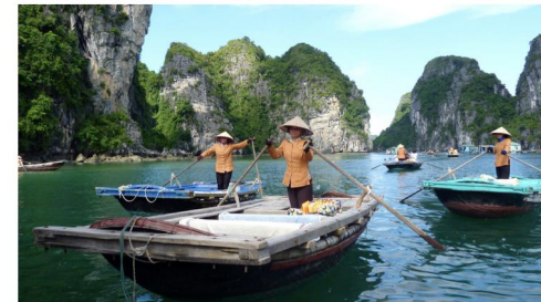
Sampans on Lan Ha Bay