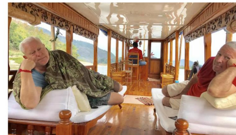
Mekong Cruise in Style