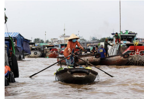
Woman Rowing Produce to Market

Fast-Track service has been arranged for our arrival at the Siem Reap airport. Upon landing, we are met by a representative who collects our passports and arrival cards. The representative then assists with our visa on arrival and immigration formalities. We collect our luggage and proceed through customs. Your passport is returned to you as you exit the terminal.