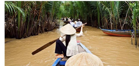
Excursion by Rowing Sampan