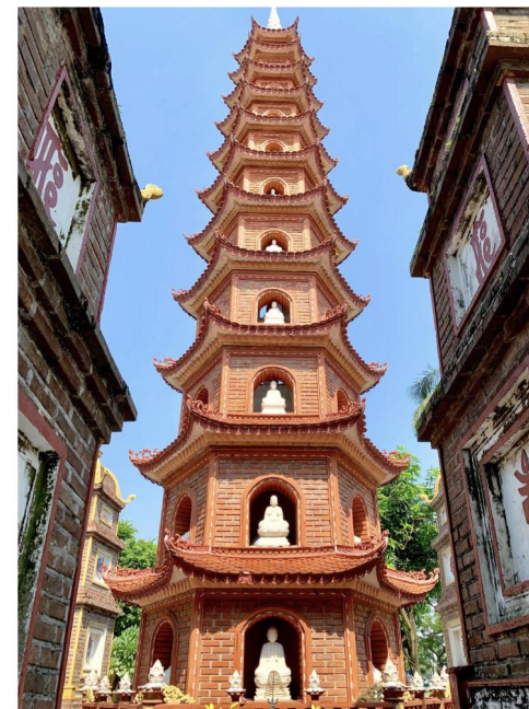
Welcome to Hanoi