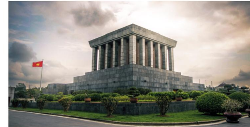
Tomb of Ho Chi Minh

We conclude our tour today by attending a traditional show at the Water Puppet Theatre, where artisans create dazzling scenes of everyday life in Vietnam, such as farmers and buffaloes ploughing rice, on a stage filled with water. After the puppet show we return to our hotel for a free evening. Overnight in Hanoi. (Breakfast / Lunch included)