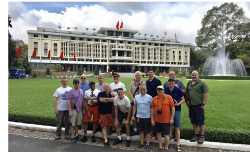
Toto Group at the Reunification Palace