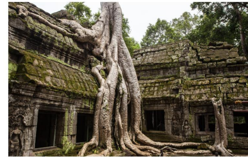
Ta Prohm Temple

After a break at our hotel to freshen up for the evening, we enjoy dinner at a local restaurant. After dinner, delight in an evening of theater, dance, music and acrobatics at Phare, the Cambodian Circus. Bringing together tightrope walkers, contortionists and visual artists, the troupe supports local youth talent and celebrates Khmer arts and culture in a spectacular hour-long production. The circus show is associated with the Phare Ponleu Selpak school in Battambang, a non-governmental organization that provides brighter futures for aspiring young performers. (All Meals)