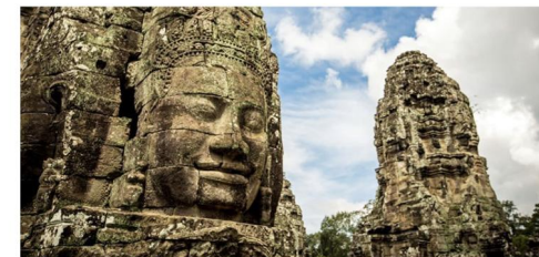
Farewell to the Temples of Angkor