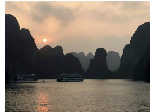
Ha Long Bay Sunrise

Saigon is the bustling and vibrant economic center of the south. Full of contrasts, the city is known for its cosmopolitan vibe and energetic pace which is unlike any other city in Vietnam. Old French boulevards and colonial architecture stand beside traditional temples and modern skyscrapers, revealing a city of captivating diversity and charismatic charm. On arrival we are met and transferred to our hotel for check in. The driving distance time is approximately 40 minutes. This evening, enjoy dinner at a local restaurant. Overnight in Saigon. (Breakfast / Dinner)