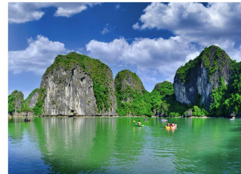
Kayaking Lan Ha Bay