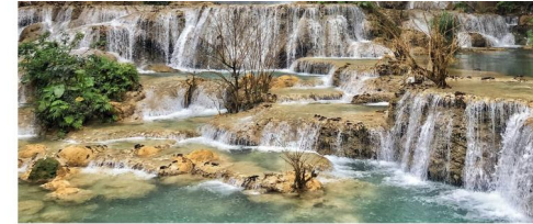
Kuang Si Waterfall