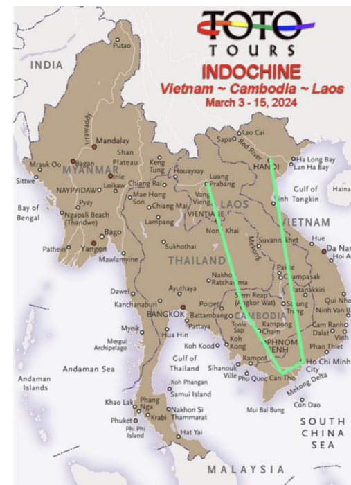
Tour Map (click to enlarge)

All plans for this tour are made considering the COVID procedures in effect at the time of publication. Entry requirements and vaccination requirements are subject to change at any time without notice. Please be sure you comply with the latest Vietnam entry requirements at the time of departure. For the safety of our groups, we encourage our tour participants to be fully vaccinated, and current with their covid vaccines (including any recommended boosters) by one month prior to departure. We ask our travelers to provide us with their vaccination records four weeks prior to departure.