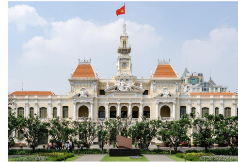
Saigon City Hall

Enjoy lunch at a local restaurant. Then learn more about the city’s history at the Reunification Palace, where the Fall of Saigon took place in 1975, and visit your choice of the History Museum or the War Remnants Museum. Built in 1929, the History Museum houses a collection of artefacts illustrating the evolution of Vietnamese culture since ancient times, while the War Remnants Museum displays wartime photographs and relics including an American tank, a 20th century French guillotine and a UH-1 “Huey” helicopter. Later, learn about southern Vietnamese spiritualism at a colorful Cao Dai temple, which takes influences from Buddhism, Confucianism, Taoism, Hinduism, Vietnamese spiritism, Christianity and Islam. We return to our hotel for a free evening in Saigon. (Breakfast / Lunch)