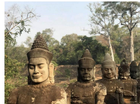
Welcome to Siem Reap