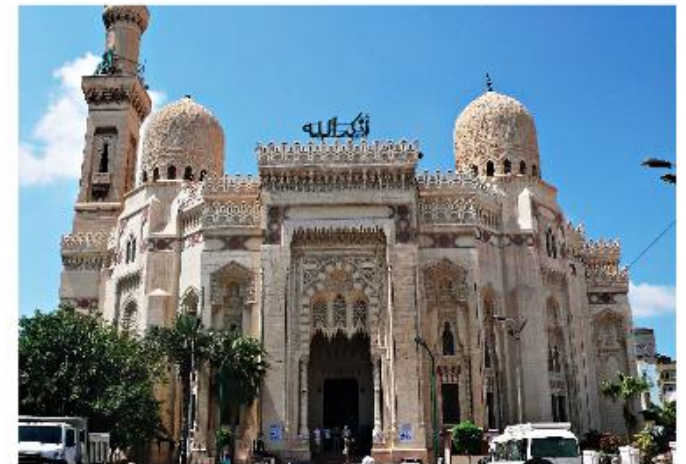
Abu al Abbas al Mursi Mosque

Enjoy a free morning to sleep in late, take a late breakfast, relax at the hotel or do some brief last-minute exploration close to our hotel. Lunch is on your own today. We depart our hotel in early afternoon and make the 2½-hour drive from Alexandria to Cairo. Once you have settled into our hotel for the start of the Main Tour, the remainder of the evening is at your leisure. Overnight in Cairo. (Breakfast)