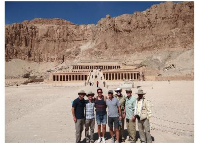
Funerary Temple of Queen Hatshepsut

After a delicious breakfast buffet on board, visit the West Bank of Luxor to explore the Valley of the Kings. We continue to the Valley of the Queens for a memorable visit to the Tomb of Queen Nefertari – one of the most beautifully preserved in the entire valley! Marvel at the grandeur of the Funerary Temple of Queen Hatshepsut. On the way back to our Nile cruise boat we stop to see the famed Colossi of Memnon. Lunch and afternoon tea are served in the lounge while we cruise to Esna, where we moor for the night. A gourmet dinner will be served on board. (All Meals)