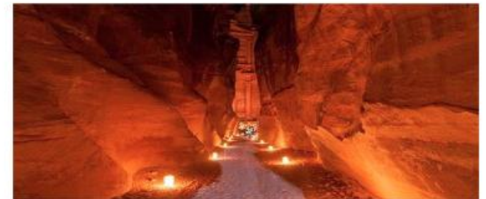
Petra By Night