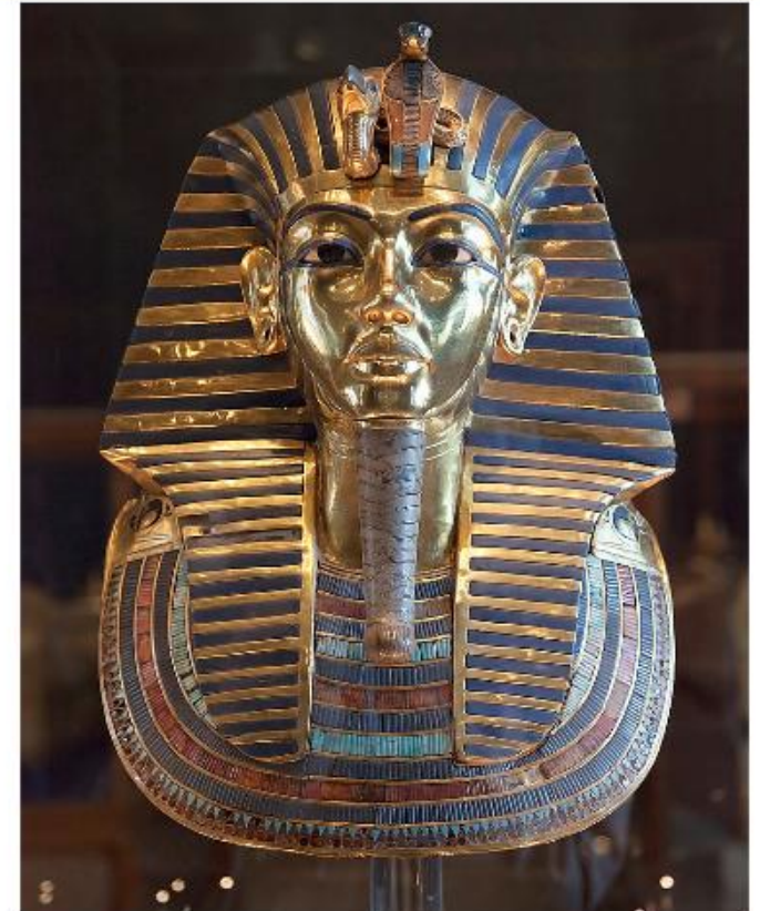
Grand Egyptian Museum

The Grand Egyptian Museum (GEM) Complex is brand new – opening in 2020! It is described as the largest archeological museum in the world displaying the heritage of a single civilization, exhibiting the full Tutankhamun collection with many pieces to be displayed for the first time. The museum is sited on 120 acres of land approximately two kilometers from the Giza pyramids and is part of a new master plan for the plateau. The Museum contains over 100,000 artifacts, reflecting Egypt's past from prehistory until the Greek and Roman Periods. As you enter the museum, you can't miss the colossal statue of King Ramses II, nor the 87 huge royal artefacts exhibited at the grand stairs. These stairs lead up to an impressive 28-meter-high glass façade overlooking the pyramids of Giza. The GEM also hosts over 5,000 artefacts from the tomb of the golden Pharaoh Tutankhamun. We will have lunch today aboard the 1901 paddle steamship Le Pacha, one of Cairo's landmark dining venues moored on the Nile. Returning to our hotel, the remainder of the day is at leisure. (Breakfast / Lunch)