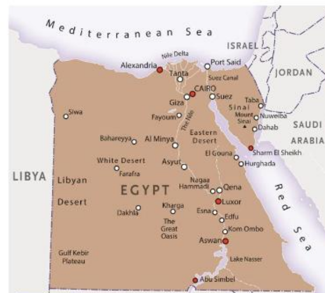
Egypt Tour Map - Click to Enlarge

If not participating in the optional pre-tour extension to Alexandria, plan to arrive in Cairo by mid-day today. We can arrange an additional night in Cairo if you wish to come early – simply let us know on your reservation form. Upon arrival at the airport, a local host will meet you and transfer you to our hotel in downtown Cairo. The afternoon is free to rest up from jet lag and enjoy the amenities of our luxury hotel. This evening our entire group will meet for the first time as Toto Tours hosts a Welcome Dinner at our hotel. Overnight in Cairo. (Dinner included)