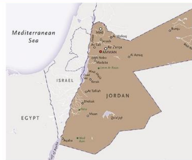
Jordan Map - Click to Enlarge

If you have come this far to see some of the most amazing sights in the world, why not extend your journey for a few more days to include the wonders of Jordan? The highlights of this extension include a float in the Dead Sea, ascending Mount Nebo, historic Madaba, incredible Petra by candlelight and daylight, the moon-like landscape of Wadi Rum, and a final night in Amman. A perfect enhancement to your Egypt adventure!