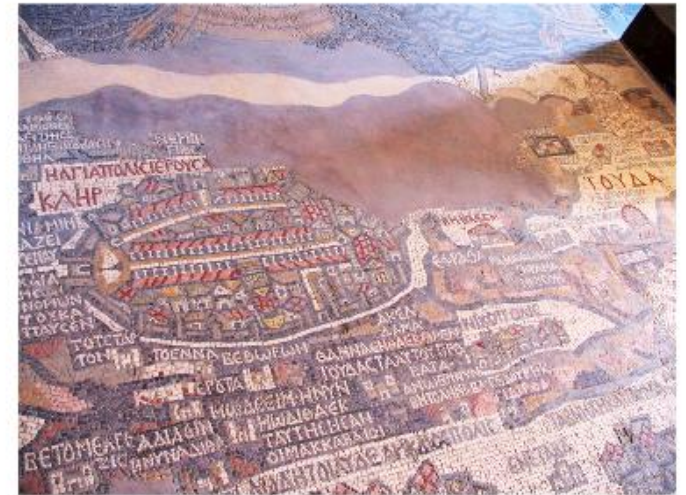
Madaba Mosaic Map

After a lunch stop, we arrive in Petra late afternoon and check-in to our hotel. We enjoy dinner tonight at a restaurant voted best in Jordan by the Grumpy Gourmet Magazine. After dinner you have the option to join our guide for the "Petra By Night" walk (not included). Experience the magical atmosphere of a candlelight visit to the rose-red city. The special aura of the ancient Nabatean trading empire comes to life as you enjoy a stroll through the mysterious Siq of Petra. At Al- Khazneh (The Treasury), listen to music and stories and experience Petra just as the travel-weary traders of old must have known it. This optional excursion departs from the Petra Visitors Center at 8:30pm, returning at around 10:30pm. Overnight in Petra. (All Meals)