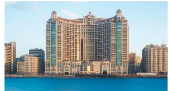
Four Seasons Hotel in Alexandria

Arrange for your international flights to arrive in Cairo, Egypt by mid-day today. Upon arrival at Cairo International Airport, a Tour Coordinator will be waiting to escort you by air-conditioned vehicle from Cairo to Alexandria. Our hotel is located on the waterfront, overlooking the Mediterranean Sea, providing a great base of operations to explore ancient Alexandria. Once you have checked into your room, the rest of the day is free to relax, unwind, and enjoy the amenities of our hotel. Dinner is included tonight at our luxury hotel on the Mediterranean Sea. (Lunch and Dinner included)