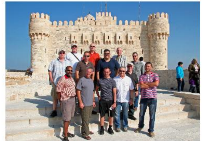
Qait Bay Fort