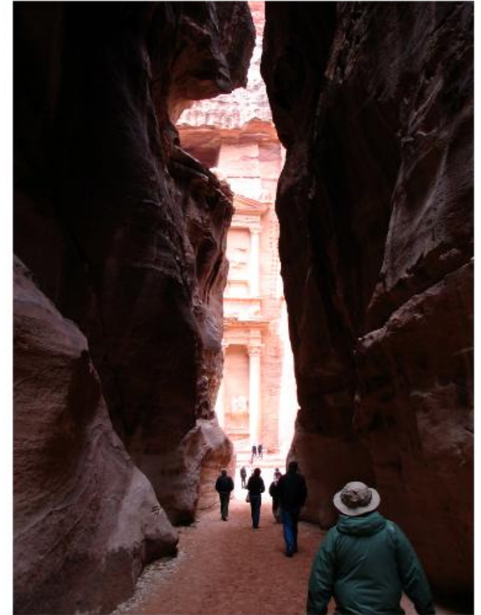
Entrance to Petra

This morning, we meet our guide at the hotel's lobby and walk with him to the Petra Visitors' Center to begin our visit to the archaeological site. Take a short horse ride from the main gate of Petra to the entrance of the old city, and then continue on foot through the winding canyon to the dramatic entrance. The ancient city of Petra was built between 800 BC to AD 100 by Nabatean Arabs. During this era Petra was a fortress, carved out of the jagged rocks in an area which was virtually inaccessible. When shipping slowly displaced caravan routes, the city's importance gradually dwindled and fell into decline. Nowadays Petra has become a popular tourist attraction, since being featured prominently in Indiana Jones and the Last Crusade (1984). During our tour we stop for lunch at the Basin Restaurant inside the Petra site. Enjoy free time to explore on your own and take amazing photographs before returning to our hotel. The afternoon is free. This evening we have dinner at Nabatean Cave Bar, located inside a Nabataean tomb in the hillside. (All Meals)