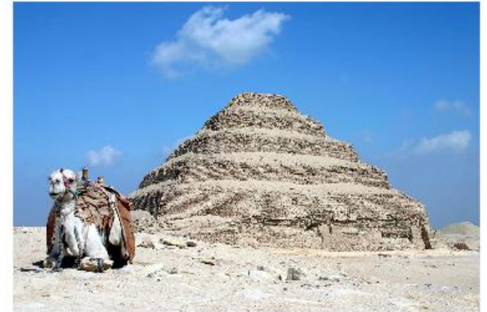
Sakkara Step Pyramid

The Great Pyramids of Giza are the only present-day survivors of the Seven Wonders of the Ancient World, built over 4,500 years ago as giant tombs for the pharaohs Khufu, Khafre and Menkaure, who were a father, son and grandson. The pyramids are truly monumental in scale, with the largest, Khufu's, constructed from over two million enormous stone blocks. We visit the Solar Boat Museum as well as the enigmatic Sphinx with the body of a lion and the face of a man wearing a royal head cloth, which workers may have based on King Khafre to guard his enormous funerary monument. We return to the hotel after a thrilling day, and the evening is at your leisure. (Breakfast / Lunch)