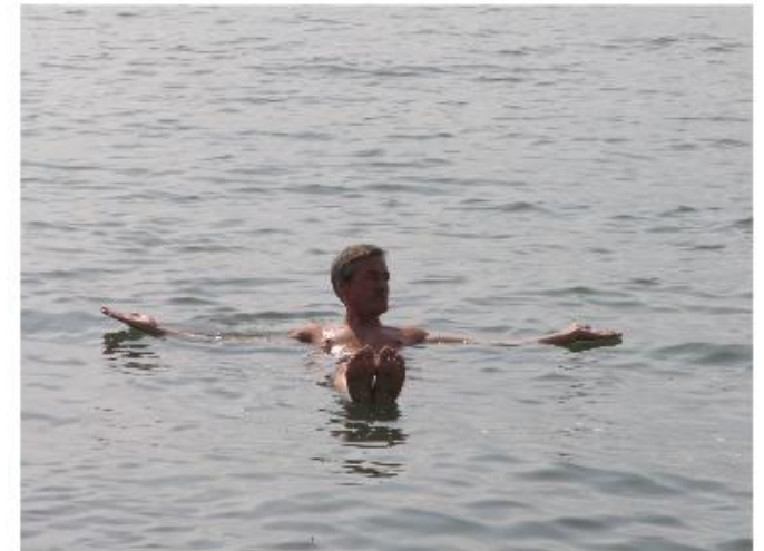
Floating in the Dead Sea

At 1,200 feet below sea level, the Dead Sea has drawn people to its shores in search of curative secrets. Due to high daily temperatures, low humidity and high atmospheric pressure, the air is extremely rich and the high content of oxygen and magnesium make breathing a lot easier. With the highest content of minerals and salts in the world, the Dead Sea water possesses anti-inflammatory properties, and the dark mud found on the shores have been used for over 2000 years for therapeutic purposes. Enjoy free time this afternoon to float in the water and take a mud bath on the shore. Dinner tonight is at an Italian restaurant located beside the infinity pool at our luxury seaside hotel. (All Meals)