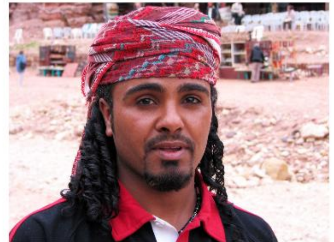
Farewell to Jordan

The tour extension ends officially after breakfast. We check out from our hotel, and board a vehicle for the transfer to Queen Alia International Airport and your flight home. Please let us know if you would like to extend your stay in Amman. (Breakfast)