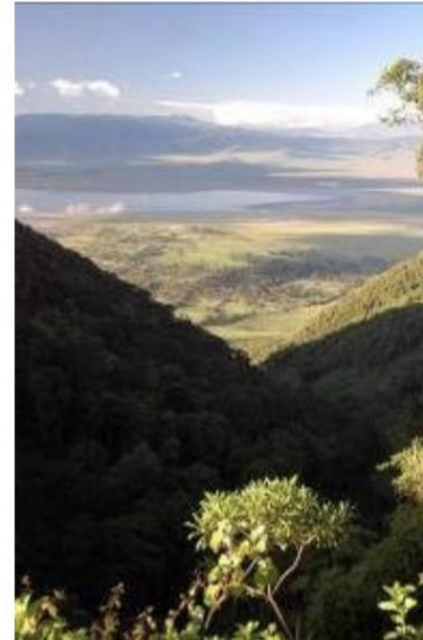
Floor of the Ngorongoro Crater