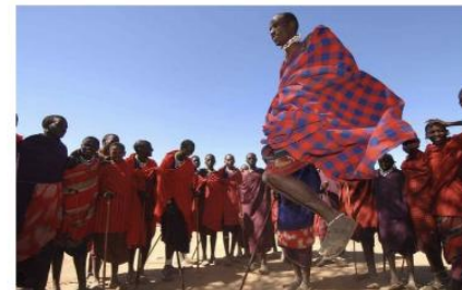
Visit to a Maasai village