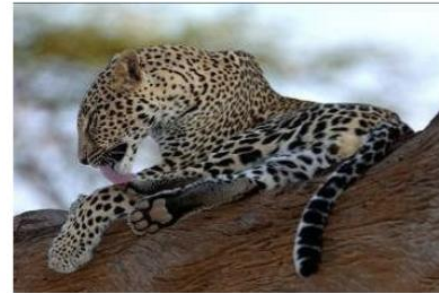
Waiting to welcome you

These two neighboring countries have dozens of ecosystems that give rise to a host of different species of mammals and birds. Here you can find everything you hope to see on Safari, including wildebeest, elephant, buffalo, hippo, zebra, leopard, cheetah, lion, giraffe, impala, oryx, monkey, baboon, rhino, dik-dik, waterbuck, jackal, gazelle, hartebeest, topi, ostrich, flamingo, heron, kingfisher, egret, ibis, stork, crested hawk eagle, and many more.