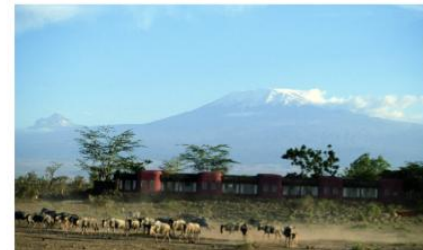
Our lodge in the shadow of Mount Kilimanjaro