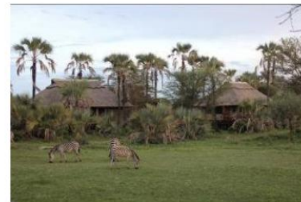
Our camp near the shores of Lake Manyara