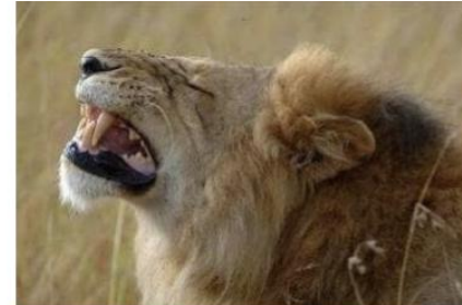
King of the Serengeti

While in the Mara, you will visit a Maasai Village to experience this nomadic tribe's way of life and see their colorful culture. You may also have an opportunity to enjoy a hot air balloon ride at an additional cost. (All Meals Daily)