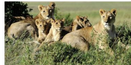
A photo to take pride in