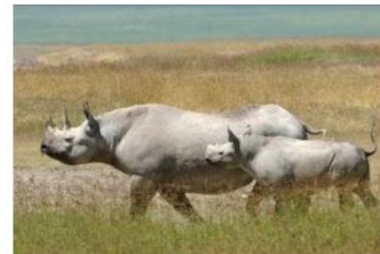
Rhino on the crater floor