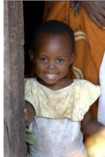
Good will ambassador in the village

Mto Wa Mbu village is one of the participating villages, located on the shores of Lake Manyara, and a living example of one of the richest linguistic mixes in Africa. Home to over 90 tribes, Mto Wa Mbu is quite possibly the only place where you can hear Bantu, Nilotic, Khoisan, and Cushitic accents spoken in the same marketplace together with the diverse lifestyles and heritage that come with these people. The village, which few tourists visit, is a microcosm of life in rural Tanzania today. Following a lunch of traditional Tanzanian dishes served under banana trees in the heart of the village, explore the area with your village guides. Your leisurely stroll will take you through local homes, farmlands where banana, millet, cassava, and corn are grown, resident bars, a kindergarten, and a church. Afterward, head to the highlands and your stunning accommodation. (All Meals)