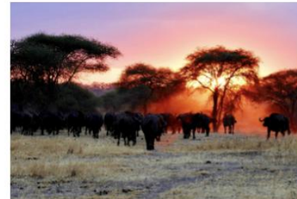
Buffalo in Tarangire National Park

This stretch of Africa is spectacular in the dry season when many of the migratory wildlife species come back to the permanent waters of the Tarangire River. Huge herds of wildebeest, zebra, eland, and oryx gather to stay in Tarangire until the onset of the rains when they migrate again to good grazing areas. For those who love birds, Tarangire has over 300 bird species. But in addition to all those magnificent trees, birds, and beasts, Tarangire is superlative for another reason—elephants. Tarangire is home to the largest population of elephants in northern Tanzania, now numbering close to 2,500 individuals. (All Meals Daily)