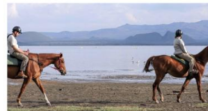
Optional horseback riding at Lake Elmenteita