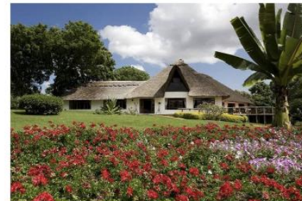
Our home at the Ngorongoro Conservation Area