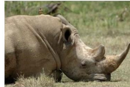
Give me a second to rest this heavy horn

While here you can enjoy several activities (at an additional cost) such as night game drives in Soysambu Wildlife Conservancy, walking safaris, bush dining, horse riding, hot springs, and bird watching game drives. Visit the Kariandusi prehistoric site and museum. Enjoy a cultural talk and a traditional dance performance. (All Meals Daily)