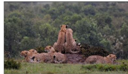
Maybe if we ignore them they'll leave