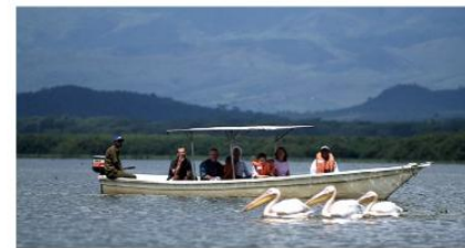
Wildlife sighting by boat on Lake Naivasha