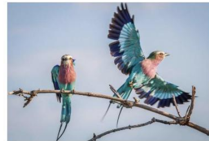
Arrive in Tanzania

Plan your flights to Africa to arrive in Arusha, Tanzania, in the afternoon or evening today. Use the airport code JRO when searching for flights. You will book your return flight from the Nairobi, Kenya, international airport using the code NBO for your search. Stepping from the plane into the fragrant African air, you realize you are finally here, at the beginning of a long-awaited adventure. You will be met and transferred to our hotel. Please indicate on your reservation form if you will arrive a day early to rest up from the long flights before our safari begins. Overnight in Arusha. (Meals Aloft)