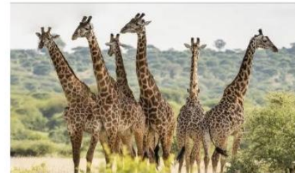
Keep your eyes peeled for those Totos

Today's drive takes you back to Arusha in time for lunch. Afterward, drive towards the Namanga border where you cross into Kenya and continue to Amboseli National Park, located at the foot of Africa's highest mountain, Mount Kilimanjaro. The snow-capped peak of Mount Kilimanjaro rises above a saucer of clouds and dominates every aspect of Amboseli. This Park covers only 150 square miles but despite its small size and its fragile ecosystem, it supports a wide range of mammals (well over 50 of the larger species) and birds (over 400 species). Years ago, this was the locale around which such famous writers as Ernest Hemingway and Robert Ruark spun their stories of big-game hunting in the wilds of Africa. This too is part of Maasailand, and it's not unusual to see the proud Maasai warrior or small children tending their cattle as you traverse their territory. In this land, animals and man have learned to coexist and thrive together, despite the harsh conditions. This is also the park that has been made famous by Cynthia Moss, the noted American naturalist, and author who has one of the longest-running studies on elephants. You might have seen some of the elephants that Cynthia has immortalized in her many books and award-winning film Echo of the Elephants . (All Meals Daily)