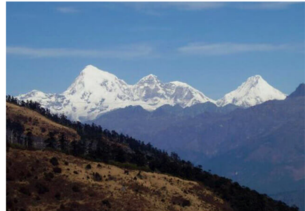
Views from Chele La Pass

This morning we return to Paro via Chele La Pass again. From the pass we will walk along the ridges, each higher than the last. You can see stunning views of Mount Jumolhari and Jichu Drake on your right and Mount Kanchenjunga in Sikkim, the world's third highest mountain, on your distant left in clear weather. If you wish to be more adventurous, you can go up to the highest ridge, Kungkarmo which stands at about 13,780 feet – the spot for sky burials. Take a well-deserved rest and enjoy the spectacular views of the Himalayas. Later we hike back to our vehicle and drive to Paro. (All Meals)