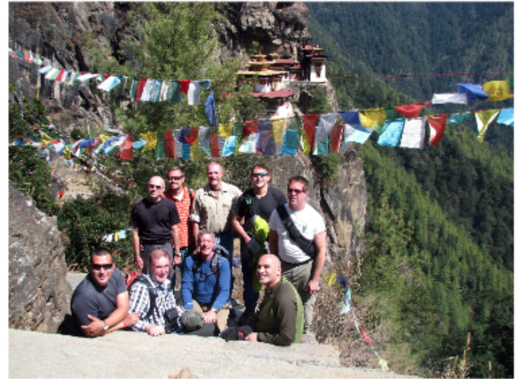
Toto Group at Tiger's Nest Monastery

Today's activity is one of the highlights of the tour – the hike to Taktsang (Tiger's Nest) Monastery. It is Bhutan's most famous monastery. It is breathtaking, situated at 10,400 feet and perched on the edge of a steep cliff about 3,000 feet above the Paro Valley. Guru Rinpoche is said to have flown on the back of a tigress from Singye Dzong in Lhuntse to meditate in a cave where Taktsang Monastery now stands. Lunch is served in the Cafeteria Restaurant, located about halfway up the mountain. After having explored the monastery, we hike down to the valley floor. We celebrate our fantastic tour in Bhutan with a Farewell Dinner this evening, and one more overnight stay at a hotel in Paro. (All Meals)