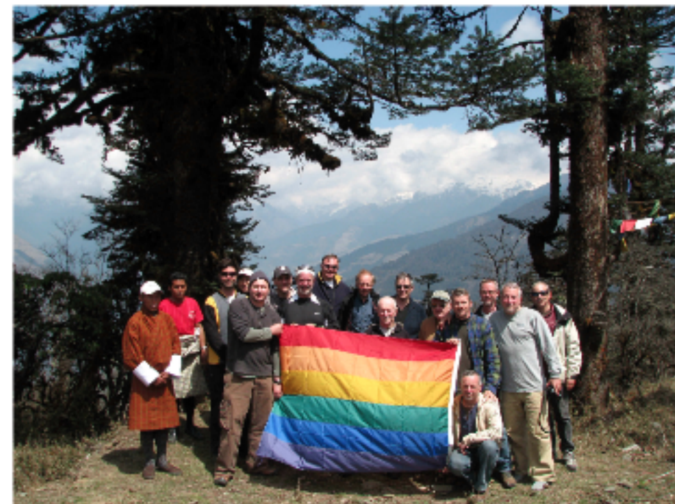
Photo stop in Chele La Pass

Today we take an exciting drive to Haa via Chele La Pass, which is at 13,087 feet elevation. The pass is dotted with colorful Buddhist prayer flags and offers incredible vistas into the valleys below. From the pass, drive downhill for about 26km through the forests of blue pine, fir and oak and arrive at Haa, a picturesque remote valley, which has only recently been opened to tourists. We will spend some time this afternoon hiking in the Haa Valley. We'll be getting acclimatized to the higher altitude and preparing for an even more adventuresome hike tomorrow. Spend the night in Hatoey village at a traditional house converted to a modern lodge. (All Meals)