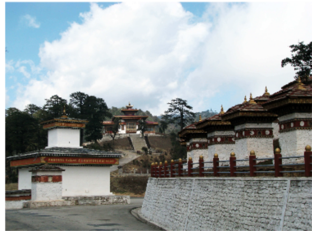
Memorial Chortens at Dochu La Pass

After breakfast, begin the drive to Thimphu via Dochula Pass, where we have lunch. Then we continue driving to Thimphu and upon arrival visit the School of Arts and Crafts (also known as the Institute for Zorig Chusum) and Folk Heritage Museum. Later in the evening visit the Majestic Tashichodzong. Overnight at our hotel in Thimphu. (All Meals)