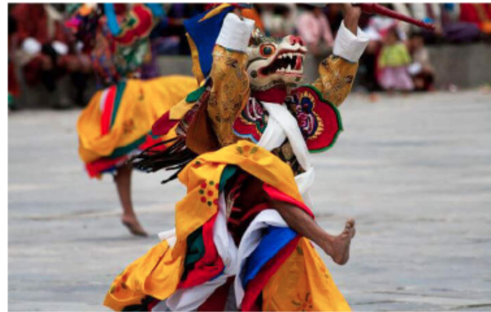
Jakar Festival Dancer

We spend today enjoying the Jakar festival dances and celebrations with locals of Bumthang and nearby villages. The festival is in honor of the teachings of Guru Rinpoche who came to Bhutan in 746 AD and introduced Buddhism. The mask dance festival is believed to bless onlookers, cleanse sins, and bring good fortune. People of all ages dress up in their best attire and come to witness the festival. It is a good opportunity to mingle with the locals. Overnight in Chamkhar. (All Meals)