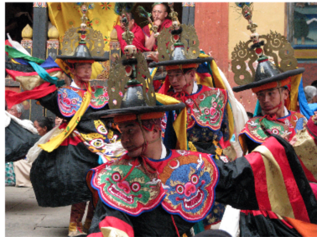
Farewell to Bhutan

Enjoy a relaxing morning at our beautiful hotel until check-out time. After lunch, we drive to the Paro Airport to catch our flight back to Bangkok, Thailand. Departure time is 4:10pm, arriving in Bangkok at 9:50pm. Tour services end with our landing in Bangkok. Schedule your departing flight from Bangkok no earlier than 2:00am on Tuesday, November 19. If you need to extend your stay in Bangkok in order to take a flight the next day, we recommend that you book the Novotel Airport Hotel directly. (All Meals)