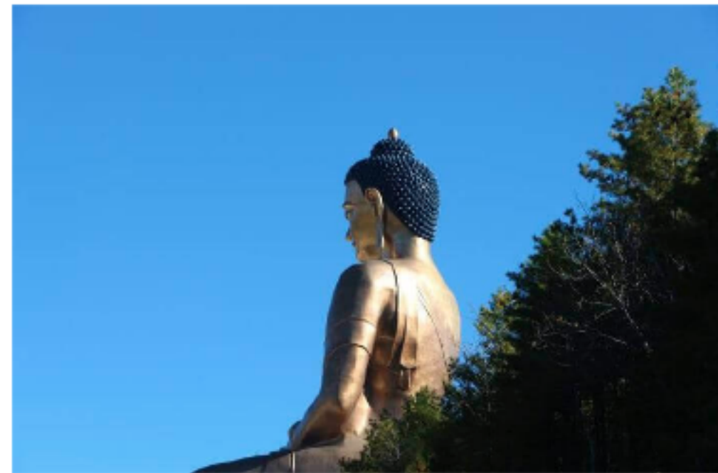
Giant Buddha Statue in Thimphu

This morning we visit the King's Memorial Chorten, built in memory of the third King of Bhutan who reigned from 1952-1972. Other place include Kuenselphodrang, where a giant Buddha statue is located, the zoo which contains the national animal of Bhutan (the takin), and the nunnery temple. After lunch, we visit the popular Weekend Market, the largest vegetable market in the country. You can see the enormous variety of foods grown in this country, including basket upon basket of fiery chilies, fresh cheese, and fruits. In addition, many stalls contain Bhutanese handicrafts and household items. This is a good opportunity for photography and to mingle with locals who come from the nearby villages to sell their farm products, and to buy some souvenirs. This evening enjoy free time to explore Thimphu town on your own. Overnight at a hotel in Thimphu. (All Meals)