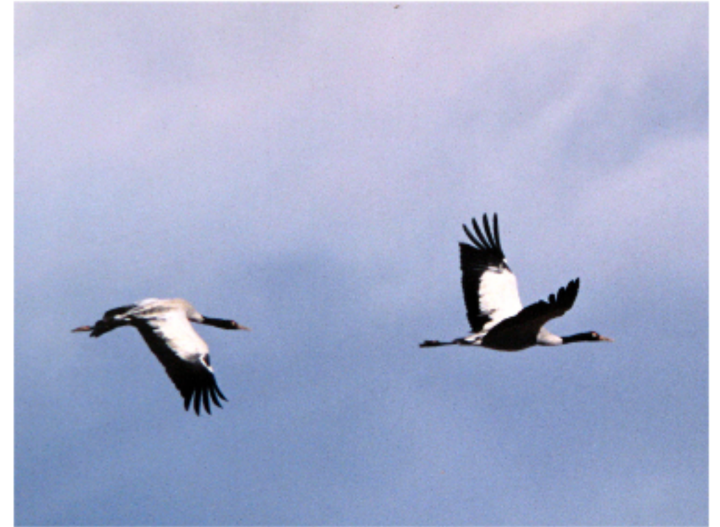
Fly from Paro to Bumthang

We drive to Paro airport for our domestic flight to Bumthang Valley. This 45-minute flight gives us spectacular views of the long east-west lateral highway as the plane glides above the highway and the border with Tibet in the north. On arrival we explore Chamkhar Town where we will be spending two nights to enjoy the Jakar Festival. (All Meals)