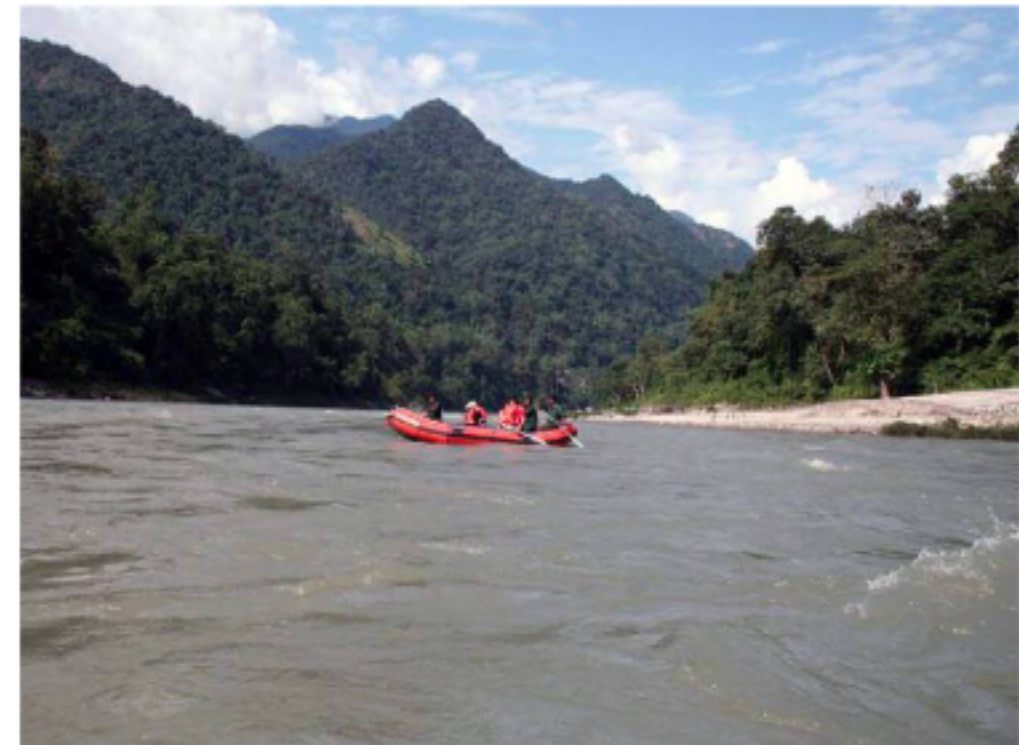
Rafting the Pho Chu River

We transfer to Punakha this morning and check in at a lovely resort. Later we take a hike to a local village. The village is reached by crossing a suspension bridge, which is the longest in Bhutan. We have an opportunity to explore the village farmhouses and learn about their architecture and the lifestyle of those who live here. A traditional lunch will be served in one of the farmhouses with Bhutanese butter tea and “ara” a local wine. After lunch we drive through other villages to reach Samdhingka (put-in) where our rafting crew will be waiting. We take an exhilarating raft adventure on the Pho Chu River with stretches of Class II and IV rapids. We raft downstream in gorgeous mountain scenery past villages, sandy embankments and continue until we reach the placid section of the river below the Punakha Dzong. Overnight at our resort in Punakha. (All Meals)