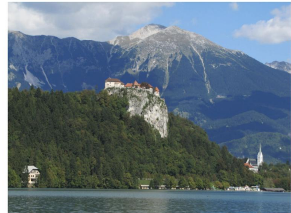
Bled Castle and Julian Alps