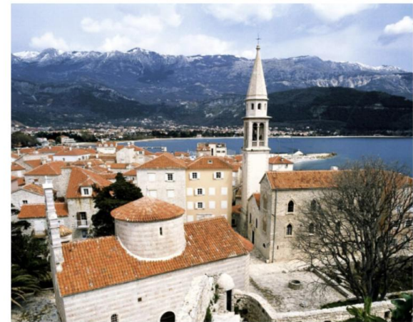
Budva Old Town

Today is dedicated to exploring Montenegro — a tiny country that boasts Europe’s southernmost fjord forming the UNESCO-listed Bay of Kotor. You simply cannot believe your eyes as you survey this breathtaking beauty. We’ll learn about Montenegrin history and culture during our guided tour of Kotor’s beautiful Old Town. Enjoy delicious seafood during lunch on stunning Kotor Bay. Afterwards enjoy a guided tour of Budva, the main seaside resort in the region. It was destroyed by a devastating earthquake in 1979, but the entire historic center has been completely restored to its original glory. Upon returning to Dubrovnik the evening is free. (Breakfast / Lunch)