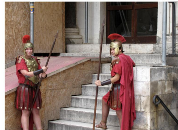
A Taste of Ancient Rome in Split at Diocletian Palace

After breakfast, board a catamaran ferry for the 2.5 hr voyage to Split. Upon arrival we check in at our city-center hotel (a mere 6-minute walk from the Diocletian Palace) and take a lunch break, after which we embark on a guided tour of this historic city. The highlight of our tour is the Diocletian Palace in the heart of Split, built as a residential palace seventeen hundred years ago by the Roman Emperor Diocletian. It is a priceless monument included in the UNESCO World Heritage list. Several scenes from Game of Thrones were filmed in the catacombs and underground hallways that are still intact and functional underneath the palace. It is here that Daenerys Targaryen's grand-looking Meereen throne room was located. The evening is at leisure to enjoy the vibe of the famous Split waterfront promenade, called The Riva. It is bursting with cafes and restaurants and is called the city's living room where everyone loves to meet and be seen. (Breakfast)