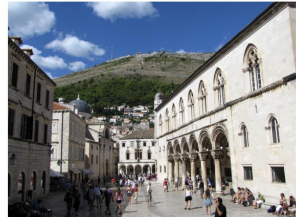
Dubrovnik Street and Mt Srd

Today is devoted to exploring and enjoying Dubrovnik — the Pearl of the Adriatic—both from the high vantage point of a panoramic plateau and within the historic old center. Walk its glorious walls with fortresses and bastions and views of the magical Elafiti Islands. From the Onofrio fountain to the city bell tower, along its main street, and in the small and quiet cobblestone streets, every step in this town will be an experience to remember. Special highlights today are the Rectors Palace, where scenes from Game of Thrones took place, and the Franciscan Monastery featuring the third oldest pharmacy in the world still in operation, dating from 1317. We end our tour with the exciting trip by cable car to the top of Mount Srd to appreciate from a birds-eye perspective the magnificence of the walled city and the surrounding area. Returning to the hotel, enjoy a free evening to sample delicacies from the restaurant of your choice in Dubrovnik. (Breakfast / Lunch)