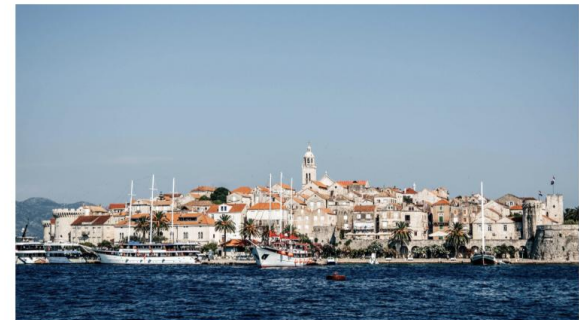
Korcula Old Town

Take time this morning to luxuriate at the hotel pool or take a dip in the sea. After checking out we take time for lunch in Korčula Old Town. This afternoon, take a guided walking tour of the medieval Old Town, the reputed birthplace of Marco Polo. It is surrounded by 14 th century stone walls and contains a succession of narrow streets that branch off the spine of the main thoroughfare like a fish bone. It has numerous gothic, renaissance and baroque palaces, monuments and galleries. Later we transfer to the port and take the catamaran ferry from Korčula to Hvar. We check into our beautiful waterfront spa hotel and walk to a restaurant in the old town for dinner. (Breakfast / Dinner)