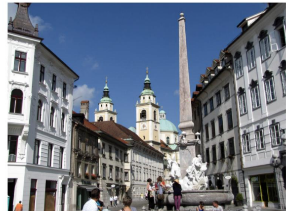
Ljubljana Fountain Square