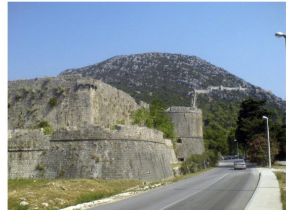
Historic Wall of Ston

We check out this morning and drive to the sister cities of Ston and Mali Ston on the Pelješac Peninsula. The two are connected by an historic wall dating from the 14th century that was once more than 4 miles long and referred to as “The Great Wall of Europe.” In addition to this architectural wonder, the Ston area is also known for great seafood. We take a private boat tour to the oyster banks of Mali Ston to savor an oyster-tasting lunch. After lunch we proceed for wine tasting in one of the most renowned Croatian wine regions — Pelješac. Continuing on to nearly the end of the peninsula, we board a small boat to cross to Korčula Island where we check into our beautiful resort hotel at Korčula Old Town for a one-night stay. The evening is free to enjoy the amenities of our hotel. (Breakfast / Lunch)