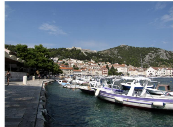
Hvar Old Town and Fort

This morning we take a guided walking tour of Hvar Old Town, best known for its medieval buildings which are the legacy of four centuries of Venetian rule. The town is the site of the oldest municipal theatre in Europe which opened in 1612. Perched high on a hill overlooking the town, the gleaming white limestone walls of the medieval Spanjol Fortress afford breath-taking views for those that climb to their summit. Optionally you can visit the Cathedral and the Arsenal followed by time at leisure to lunch while you enjoy Hvar Town's stonepaved harbour front, the Venetian piazza and yacht harbour with views across the sparkling Adriatic Sea. After our lunch break we embark on a fabulous Wine & Culinary trip on Hvar Island. Visit two wineries for tastings of wine, cheese, bread, and olive oil and learn about how wine is made. First, the Romanesque cellars of Andro Tomic (togas optional). He is a French-educated vintner from Jelsa and also the face of Croatian EU integration in his battle to protect the Prosek brand. Continue to another part of the island to Zlatan Otok, Hvar's most famous producer, featuring underwater tasting rooms, Decanter gold medals and Croatia's only Grand Cru. Complete the day with a traditional dinner in the village of Malo Grablje. Return to Hvar Town for overnight. (Breakfast / Dinner)