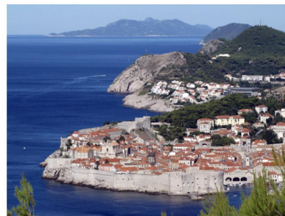
Arrive in Dubrovnik

Arrive today at the Dubrovnik International Airport. Use the code DBV when searching for flights. Because international airfare is not included and participants will arrive on different flights (perhaps even on different days), we are not including a group transfer from the airport to the hotel. Final documents sent three weeks prior to departure will detail your options for booking a private transfer or for making your way to our hotel using public transportation. Our rooms should be available for check-in by 3:00pm. If you arrive early, enjoy time for independent exploration of our hotel and its environs. Please let us know on your reservation form if you prefer to arrive one day early in order to relax and recover from jet-lag before the tour commences. We convene at the hotel bar this evening for drinks before continuing to one of the great restaurants in Dubrovnik for our Welcome Dinner. (Welcome Dinner included)