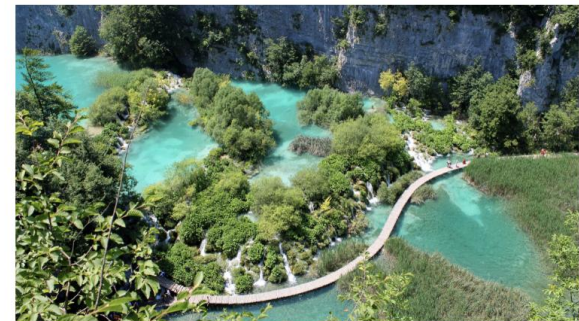
Plitvice Lakes National Park

Plitvice Lakes is the oldest and largest national park in Croatia, and it has been listed as a UNESCO World Heritage Site since 1979. Within the boundaries of this heavily forested park, 16 crystalline lakes tumble into each other via a series of waterfalls and cascades. The mineral-rich waters carve through the rock, depositing tufa in continually changing formations. Walk through clouds of butterflies along some of the miles of wooden footbridges and pathways that snake around the edges and across the roaring waterfalls. Take a short boat ride on one of the larger lakes to an island with a small church. Continue to the Croatian capital, Zagreb, where we check into our hotel and walk to a nearby restaurant for dinner. (Breakfast / Dinner)