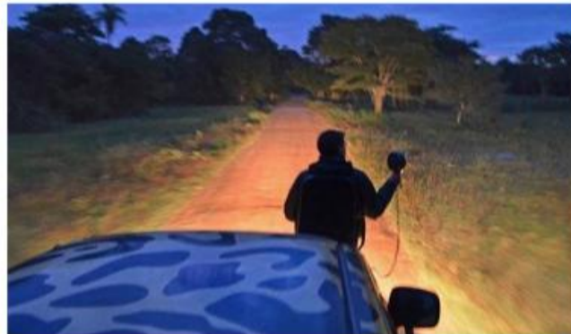
Dusk Game Drive

This morning, we leave the Estancia with plenty of time to make the 4-hour land transfer back to Campo Grande Airport (CGR) for a return flight to São Paulo and connections for departure flight. If you wish to extend your stay in São Paulo, or continue the optional extension to Rio, please let us know on your reservation form. (All Meals)