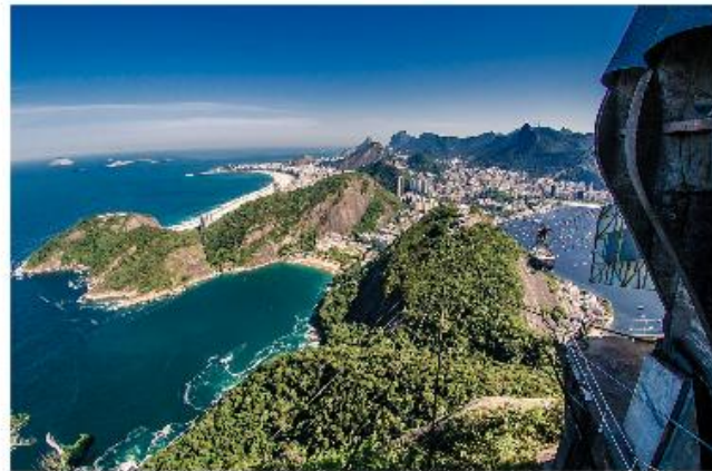
Sugar Loaf Mountain

You will have breakfast at the hotel and the morning is at leisure. At the appropriate time, you will transfer for the airport (GIG) to board your international flight back home. (Breakfast)