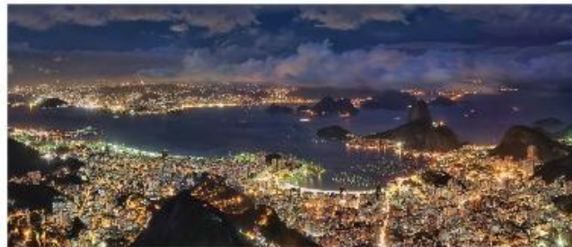
Rio At Dusk

Perhaps no other destination in Brazil is more legendary than Rio de Janeiro — known for its Samba, Carnival and dazzling beaches. This former colonial city also boasts historic architecture, incredible natural scenery and iconic sights. Considered by its six million inhabitants, the Cariocas, as the "Cidade Maravilhosa" (Marvelous City), Rio's reputation precedes it. Images come to mind of stunning mountains, glittering carnival costumes, skimpy bikinis and speedos, and the endless rhythm of samba. However, behind all the glitz and glamour, this wonderful city, located in the Southeast Region of Brazil, is also rich in history and culture. There are many fine buildings, historical neighborhoods and museums from its time as the capital of Brazil. The Cariocas are very friendly and welcoming people, guaranteeing that your Brazilian vacation will be a memorable one.