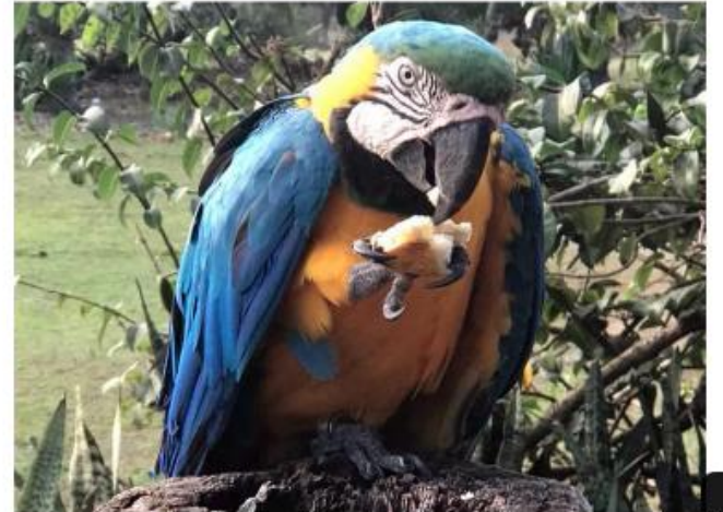
Blue And Yellow Macaw