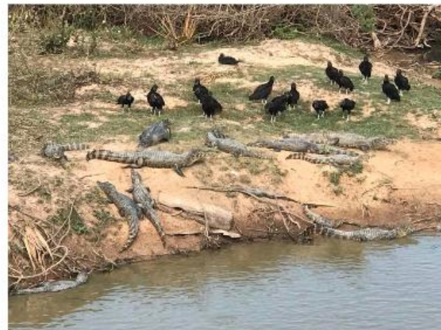
Caiman And Birds

The Caiman Ecological Refuge is a pioneering ecotourism enterprise in the Southern Pantanal, situated on a 53,000 hectare cattle ranch, Estancia Caiman. In addition to ecotourism, Caiman is involved with cattle production, as well as environmental research and conservation projects, including the Hyacinth Macaw Project, Onçafari (Jaguar) Project, and Blue-Fronted Parrot Project, all done through partnerships with researchers and universities. The activities at Caiman start very early in the morning taking full advantage of the best portion of the day to observe the wildlife. After that, the guests return to the lodge, have lunch and rest. When temperatures cool off in late afternoon, it is time to go out for an afternoon excursion to see more of the Pantanal and enjoy a wonderful sunset. (All Meals)