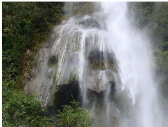
Boca Da Onca Waterfall

After breakfast and check out, depart for a full day to Boca da Onça Farm with hiking. The tour comprises a walk on a trail through the pristine forest, passing by more than ten crystal-clear waterfalls, the scenic Salobra River and bathing ponds in natural pools. The highlight is the Boca da Onça waterfall, near where you will also be able to go for a swim. It is 512 feet high, making it the State's highest. It is a hike for those who love nature and are fond of beautiful landscapes, but you have the option of doing part of the itinerary by 4WD vehicle. Upon return to the main house you will find a typical meal, served as you enjoy the beautiful reception area or swim in a pool with several regional fish such as dourado, pintado (catfish) and piraputanga. (All Meals)