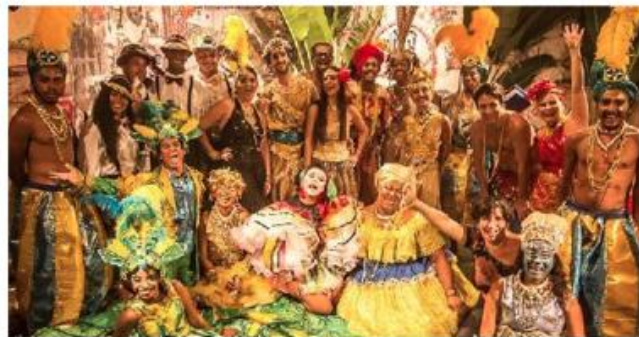
History Of Samba

After breakfast, enjoy a full-day sightseeing tour. We begin with an inside look at the creation of Carnival. You will learn about the construction and production process of costumes and floats, visit a samba school warehouse, see exhibits about the history of Samba and the Carnival Parade, and try dressing up in luxury original Carnival costumes to take amazing pictures. Continue for lunch at one of the best barbecue restaurants in town. After lunch continue to Sugar Loaf Mountain, riding a cable car to the top of Urca Hill to the gardens and lookout points over the Guanabara Bay, where you can appreciate Rio`s unique landscape. Afterwards, take a second cable to the Sugar Loaf peak, nearly 1,300 feet above sea level. The views of the beaches, the Bay, hills and harbor are breathtaking from this vantage point. (Breakfast / Lunch)