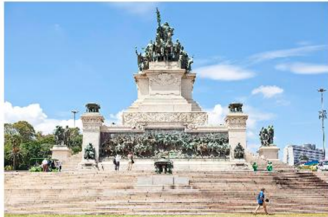
Sao Paulo Monument To Independence

Once a quiet working-class neighborhood, Vila Madalena has seen many intellectuals and students of the nearby Sao Paulo University move in and transform the area forever. Nowadays it is one of the city's leading creative neighborhoods, home to design shops, local designers, new artists workshops and countless bars, restaurants and other entertainment options, giving it a lively bohemian atmosphere with a local flavor. Unlike the usual gentrification you see in many cities, the work of artists, painters, and sculptors spills out of the shops into the streets and onto the concrete itself with colorful graffiti. This one-time hippy hub and now arts district is a world unto itself. After our late night, we'll have a relaxed start this morning, enjoying the art district and a free evening. Overnight in São Paulo. (Breakfast)