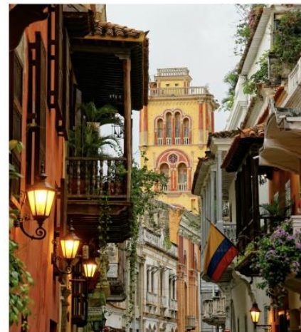
Colorful Old Town