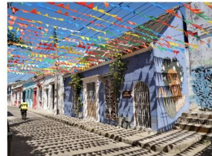
Colorful Getsemani Street