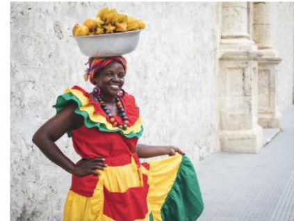
Welcome to Cartagena

Stroll the town by day and explore the museums, galleries, and emerald factories. For some dramatic panoramas of the city and the coast, head to La Popa church and the Fortress of San Felipe. At night you can take in one of many live music venues or perhaps sip a sundowner at a bar overlooking the ocean. Take a boat trip out to the archipelago of islands known as the Rosarios Islands for superb snorkeling and diving.