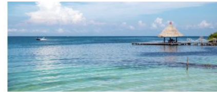
Snorkle Clear Waters

Our final day in Colombia is dedicated to indulging in the wonderful amenities and optional activities at our beautiful resort hotel. Pamper yourself at the spa; take a mangrove tour; spot exotic birds during an aviary tour; relax on the beach. The day is yours to fill as you desire.