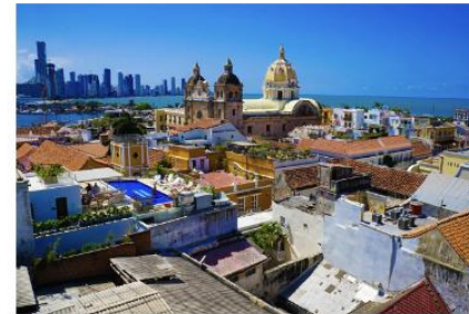
View of Cartagena

Our "Street Art & Graffiti" tour gives you a deeper insight of Cartagena, with a special focus on the alternative and cultural quarter and the coolest barrio: Getsemaní. The stories are told by present graffiti paintings which include images of tropical scenes, palenqueras and local flora and fauna. In Getsemaní the individuality and spirit of the neighborhood stays intact. You can come as a tourist but you surely leave as a local, understanding what makes the barrio so special with the people engaging themselves a lot to ensure that it preserves its particular charm. This neighborhood has shaken off its bad reputation and started to make use of street art as a way of incorporating the voice of local residents and artists into the fabric and the narrative of the city streets. Graffiti transformed this neighborhood a lot in the last years, especially after the first Graffiti Festival in Getsemaní that took place in December 2013.