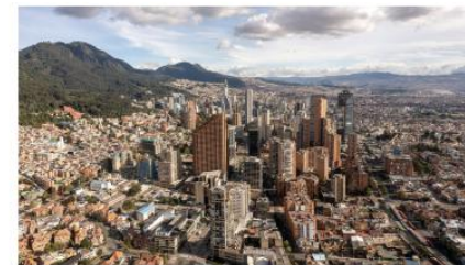
Aerial City View