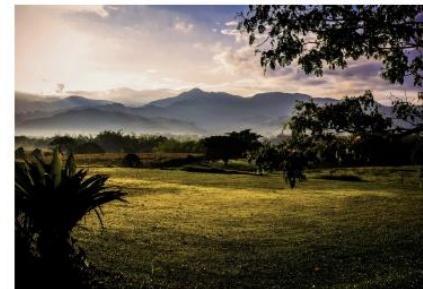
Sunrise in Colombia's Coffee Region

This morning, we indulge in the rich Colombian coffee culture by visiting a traditional coffee farm nestled in the lush hills of Medellín. This unique experience offers a fascinating glimpse into the daily life of a Colombian coffee farmer. Wander through the verdant coffee plants and learn about the entire coffee production process, from seed to cup. You will be amazed at how close to the bustling metropolis of Medellín the idyllic Colombian countryside is. This excursion promises to be an unforgettable cultural adventure that will leave you with a greater appreciation for the art of coffee making. Lunch is included at a local restaurant.