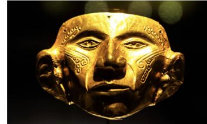
Gold Museum Artifact

After lunch we experience the excitement of playing “Tejo.” This traditional indigenous sport has been played in Colombia for over 500 years. The game involves throwing a metal piece called a “tejo” onto a board with clay and gunpowder, aiming to hit a small target in the center. You definitely know when you hit it! Playing Tejo is not only a fun way to spend time with friends, but also an opportunity to immerse yourself in Colombian culture. Enjoy a local handcrafted beer while you play and see if you have what it takes to hit the target. We return to the hotel for a free evening. (Breakfast / Lunch)