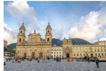
Plaza de Bolívar