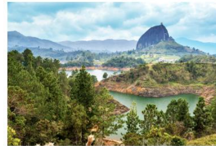
Guatapé and El Peñol

Get ready for an amazing adventure as you head out of the city and drive for approximately 2 hours to the picturesque resort town of Guatapé. Marvel at the breathtaking landscape of Antioquia as you make your way to this vibrant town. Guatapé is known for its colorful pastel painted buildings and cobblestone streets. It is situated on a man-made reservoir that dates to the 1970s and was created to provide hydroelectricity. Today, the area is home to a series of connected lakes and in the middle of the reservoir is El Peñol rock. This enormous rock, thought to be a meteorite, is a sight to behold. For the adventurous, climb up its 654 steps to the top and enjoy a fantastic view of the surrounding area. After lunch, hop on a boat and explore the area further with a relaxing trip around the reservoir. In the afternoon, we'll return back to Medellín, concluding a fun excursion that will take around 8 hours. Enjoy one more free evening in this exciting city. (Breakfast / Lunch)