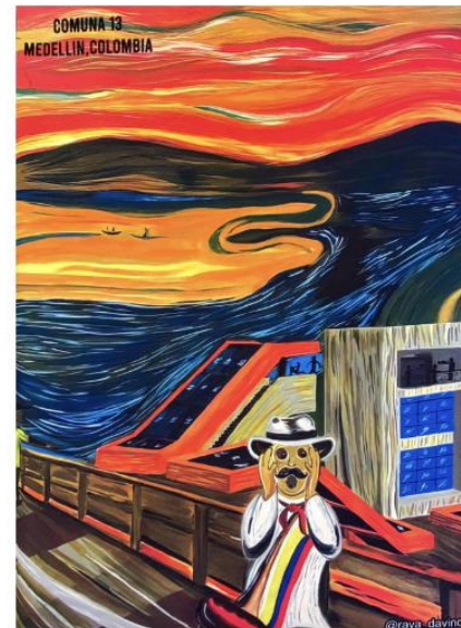
Art and Graffiti Tour

The city of Medellín has undergone a significant transformation in the last 20 years, resulting in a diverse range of urban art that reflects the city's cultural heritage. With an abundance of street art, the local authorities have recognized it as a cultural landmark of Medellín. Graffiti is not just about showcasing artistic and cultural elements; it also serves as a means of political expression. On this tour, you will have the opportunity to explore the graffiti of Comuna 13, guided by local artists who will provide you with an insightful history of the area and how street art is vital for social communication and identity. (Breakfast / Lunch)