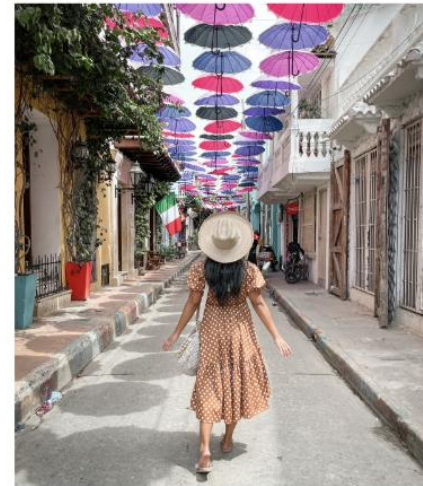
Farewell to Colorful Colombia

After breakfast today we transfer together to the Rafael Nunez International Airport in Cartagena to take your international departure flight. Everyone will want to utilize this one included transfer as we are a long ways from the airport and private transfers will be very expensive and payable through the hotel. We will time the group departure to accommodate the earliest departing flights. It takes approximately 1.5 hours driving from the hotel to the airport, and you need three hours pre-departure for check-in. Please do not book any departing flights before 2pm so we don't have to leave super early. If you are not able to book an afternoon flight out of Cartagena, we can arrange an additional night for you at our Cartagena hotel so you can take a morning flight tomorrow. (Breakfast)